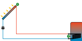
Internal heat exchanger, intelligent pump control